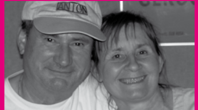
milo from the kitchen marica for housekeeping