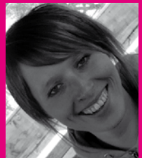
kathi from the square