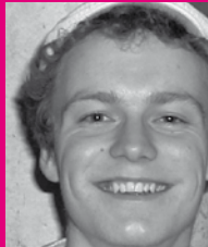
stoffl joker in the kitchen