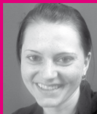
ines from the reception