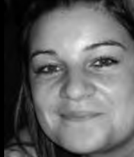
from the café (second season)